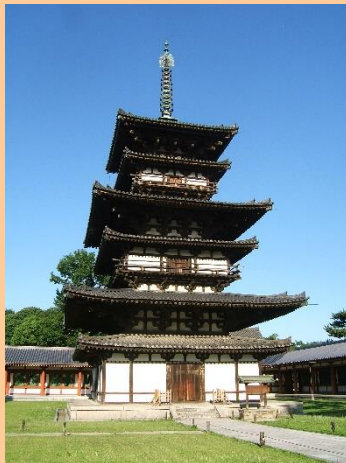
Copyright ©2016 Nara travellers guide. All rights reserved.

Subsequently, the temple was transferred from Fujiwara to Heijo-kyo in 718 along with the move of the capital. The Tower was lost due to numerous disasters, except for the East Tower, but it is now being reconstructed and was registered as a UNESCO World Heritage Site in 1998.