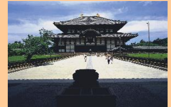
Copyright ©2016 Nara travellers guide. All rights reserved.

◆ Todaiji Temple is one of Japan's most famous and historically significant temples and a landmark of Nara.