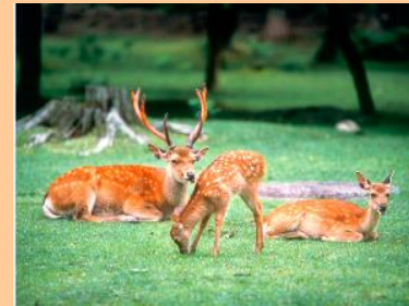
Copyright ©2016 Nara travellers guide. All rights reserved.

◆ Nara Park is a large park in central Nara which is established in 1880. The park is a home of hundreds of freely roaming deer.